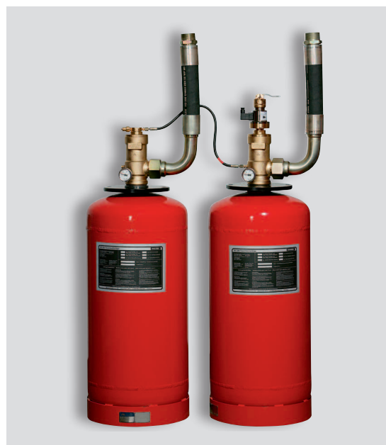
Example of a multi-cylinder system